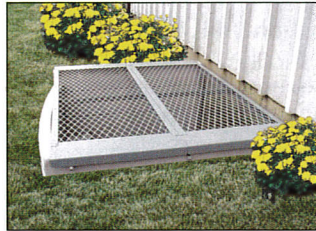
Metal Grate Cover

Keeps well area clean of snow, leaves and debris. Constructed of polycarbonate, this high impact cover is UV-resistant and designed for durability and long-life.